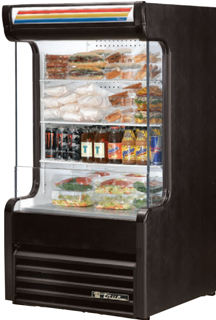
Shown with optional exterior.