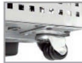
1½" diameter dual swivel castors for "LP" models.