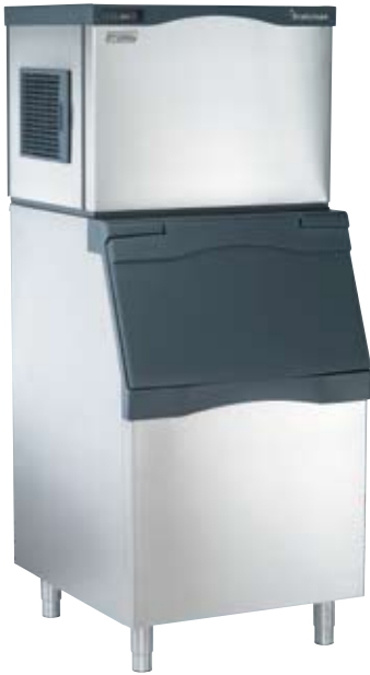
Shown on B530S bin with optional KLPSS legs.