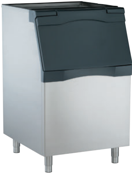
B530S shown with optional KLP8S legs