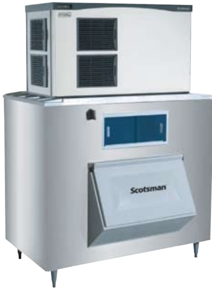
Shown on BH1600SS bin.