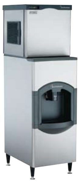
HD22 shown with a Prodigy CO322A cuber