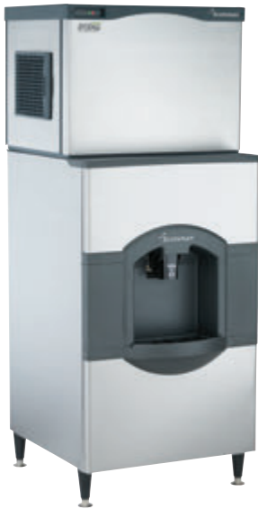
HD30 shown with a Prodigy C0330A cuber