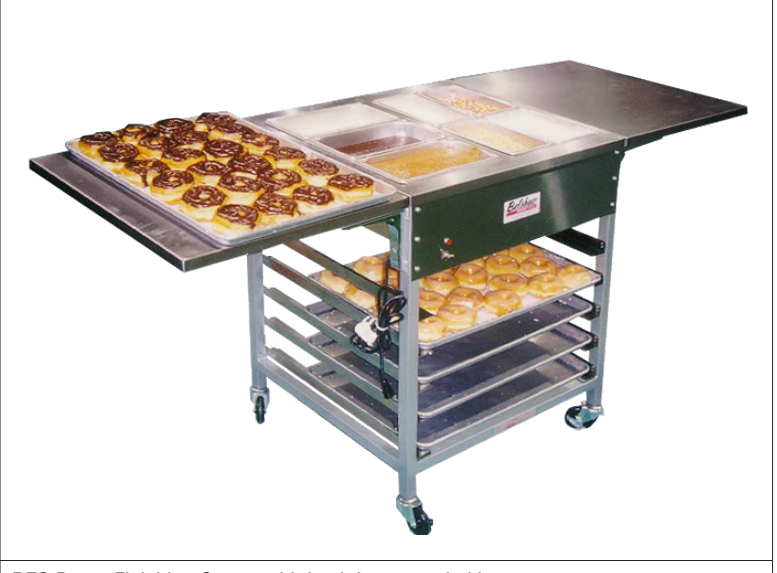
DFC Donut Finishing Center with iced donuts on baking trays