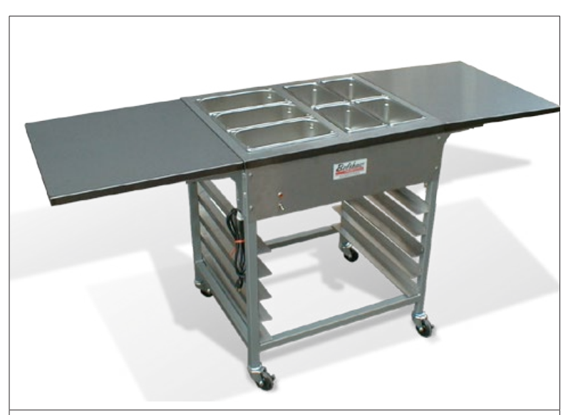
DFC Donut Finishing Center