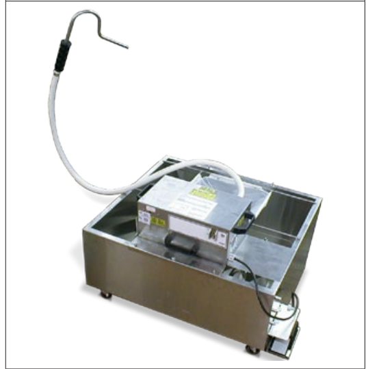
SF34 Shortening Filter