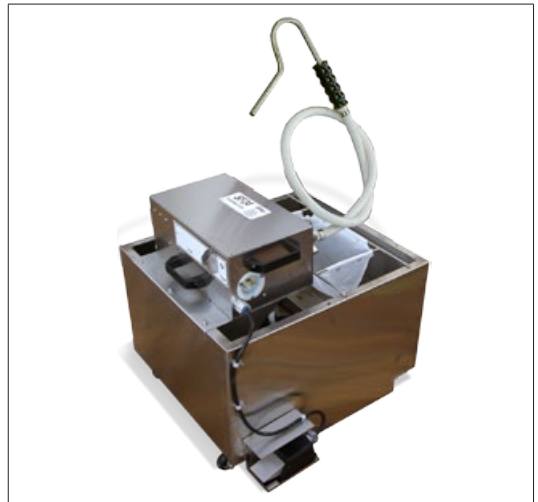
SF24 Shortening Filter