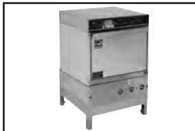
Optional pedestal allows the L-1X16 to be raised up to a full 12" off the floor for easy operator use. Height adjustable from 8" to 14".