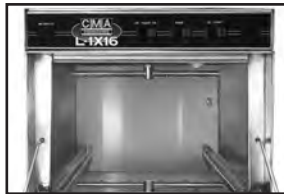
Upper and lower rotating wash arms guarantee excellent results.