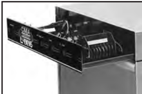
"Works-in-a-drawer", may be removed by disconnecting wires from terminal block.