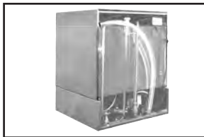
Pumped drain will drain uphill. Requires no floor drain.