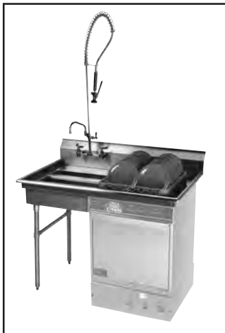
Optional dishtable, faucet and pre-rinse unit sold separately.