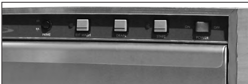
Top mounted controls are easy to read and simple to operate.