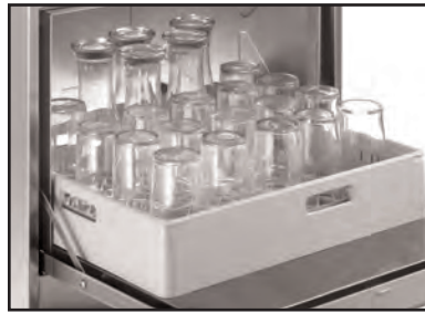
Uses standard 19-3/4" X 19-3/4" racks.