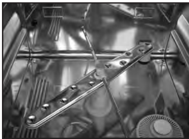
Upper and lower wash and rinse arms guarantee excellent results.