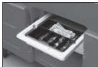
Open holding compartment holds cash drawer and box. (included)