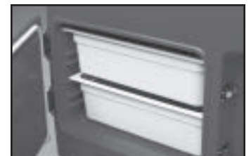
Two insulated holding compartments each hold up to 4 each GN 1/1 Full Size 6" (15 cm) deep Food Pans.