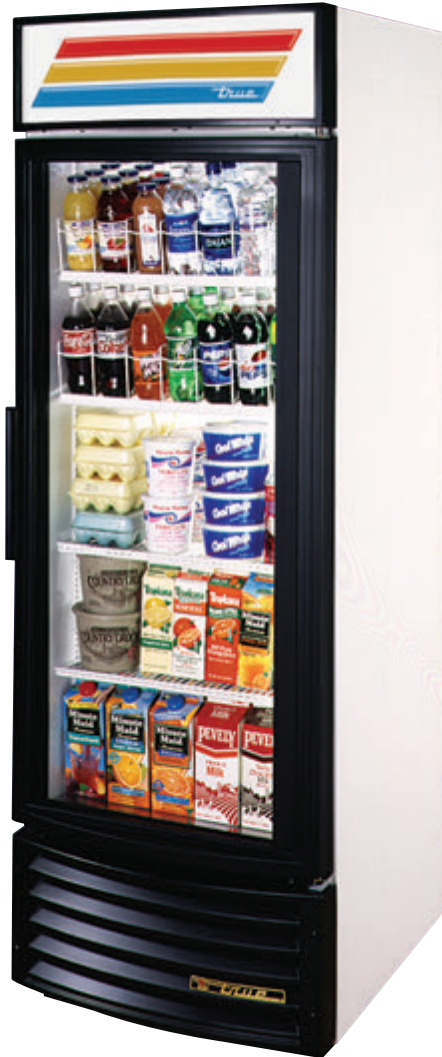
Shown with optional shelving.