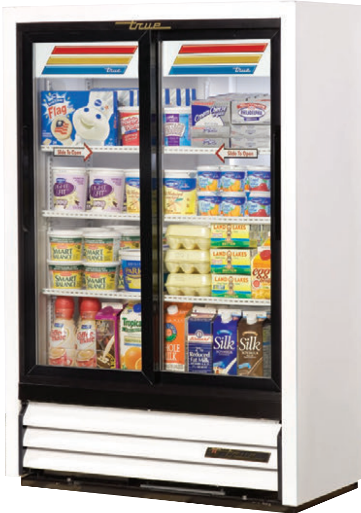
Shown with optional shelving.