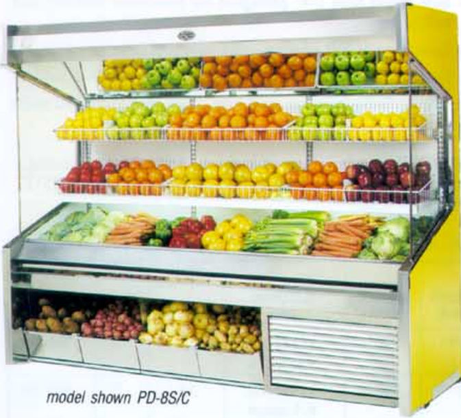
model shown PD-8S/C