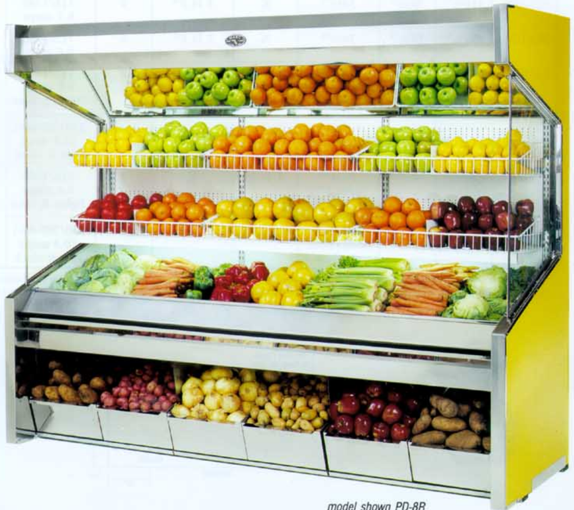
model shown PD-8R