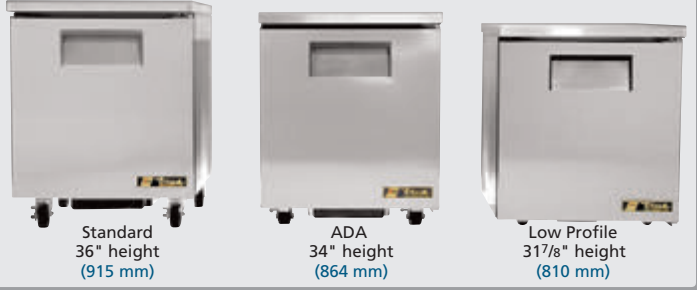
Standard 36" height (915 mm)