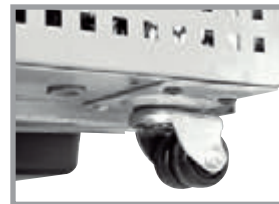
1½" diameter dual swivel castors for "LP" models.