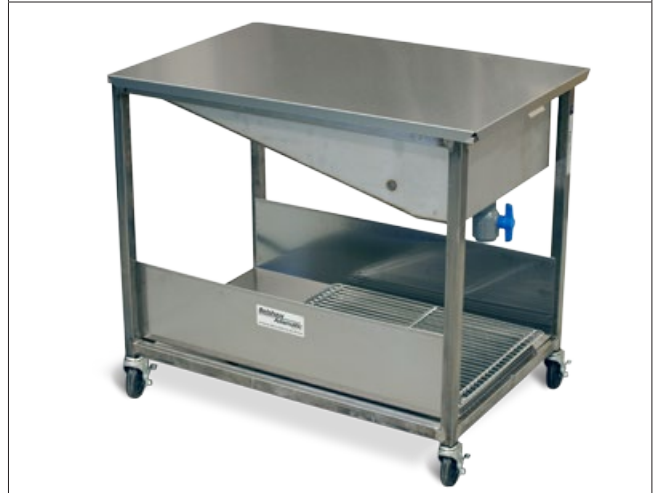
HG18C Standard Glazer shown with supplied cover (HG24C is 7" wider) (Glazing screens are supplied separately)