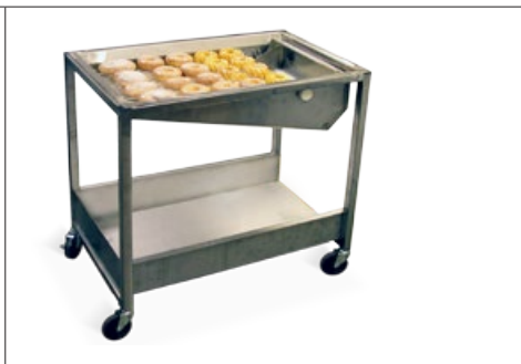
HG18C Glazer with Donuts