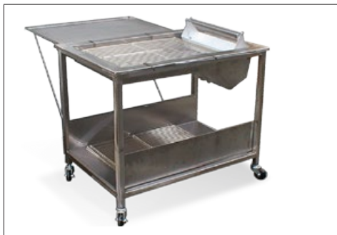
HG18C Glazer with Drain Tray