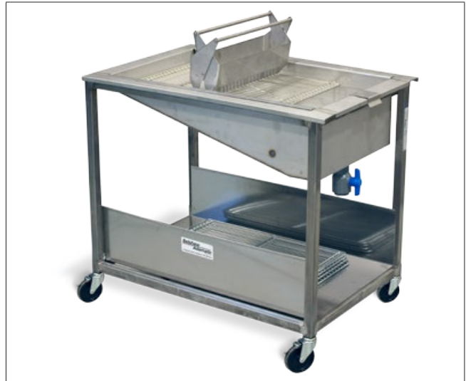
HG18C Standard Glazer (HG24C is 7" wider) (Glazing screens are supplied separately)