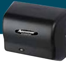
Steel Black Graphite